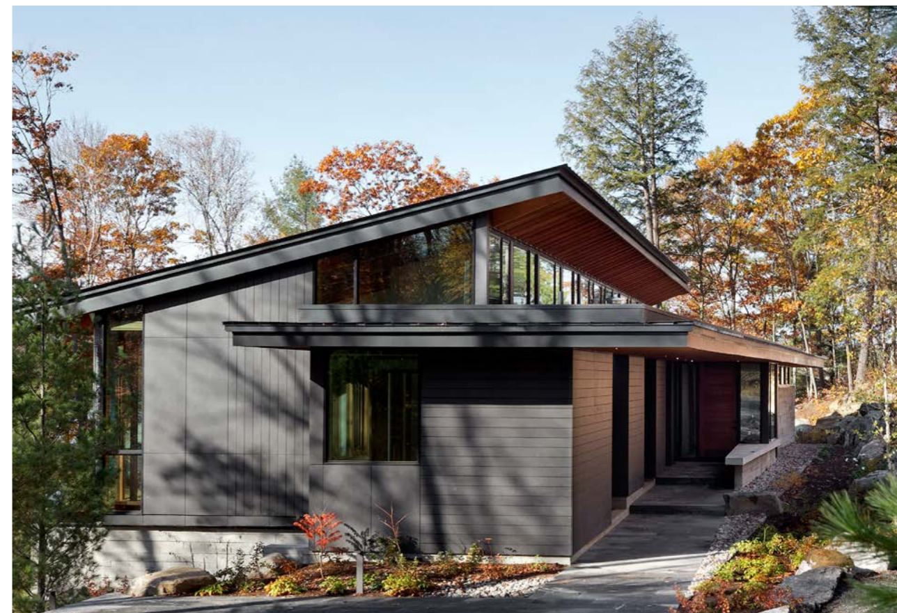
House on Haliburton Lake, Ontario, Canada. Architect: +VG, Toronto, Canada.

The highly resistant standard coating makes these panels particularly scratch-resistant and protects them from heavy soiling and graffiti. The transparent coating allows the natural appearance of the fibre cement to shine through, creating a lively surface look with varied texture and dynamic colour tones.